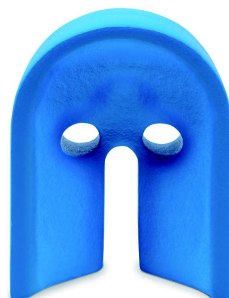
Head support for prone position Dimensions: 280x225x120 mm