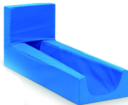
Leg splint 2/2 coated polyurethane 750 x 300 x 350/135 mm