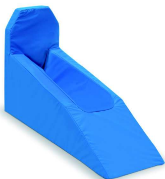
Leg splint 1 coated polyurethane 750 x 250 x 480 mm